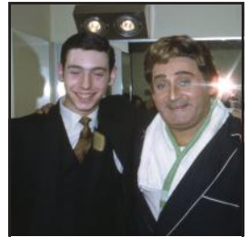
Backstage at The Met after 1968 Luisa Miller

Richard Tucker was a brilliant performer who never failed to thrill his audiences. Richard Tucker was a mentor who truly embraced my dreams. Richard Tucker allowed this young man to befriend and demonstrably love him. I miss him and am inspired by him every day of my life. It is my honor to dedicate this concert of Puccini's music, which he dearly loved and performed magnificently, to his blessed memory. "Amici in vita, in morte."