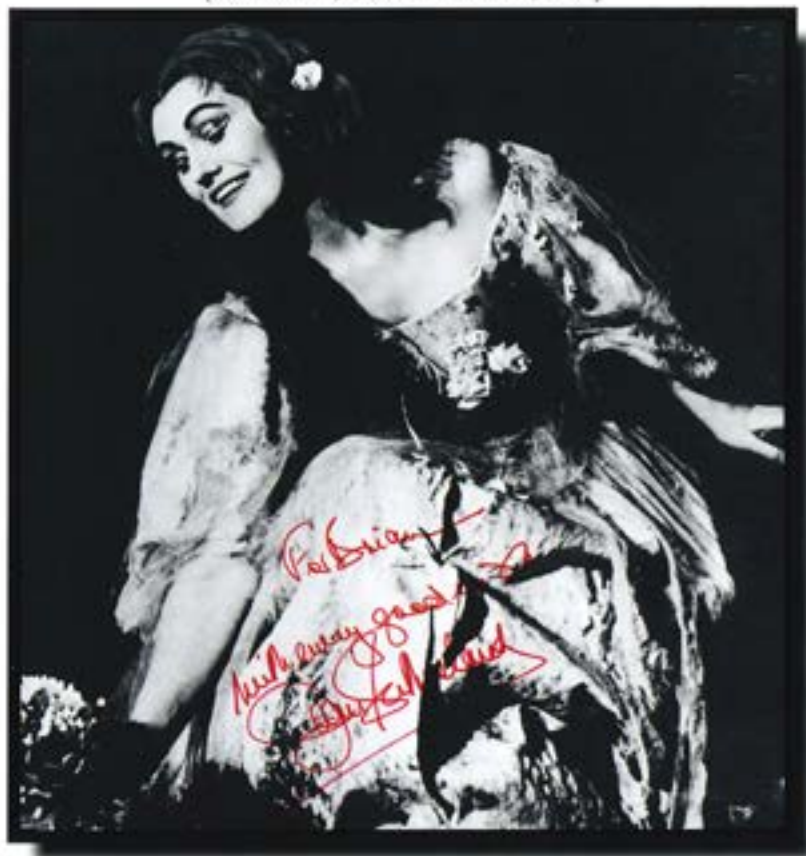
Joan Sutherland as Elvira in I Puritani

During the course of their illustrious four-decade career, Dame Joan and her husband, Maestro Richard Bonyng, championed the genre of opera called bel canto . Without their bringing to life works by Bellini, Donizetti and Rossini it is unlikely that ours or any company would be performing many of these operas. Joan's spectacular I Puritani was recorded twice and three of opera's greatest tenors (Pavarotti, Gedda and Kraus) partnered her Elvira on stage.